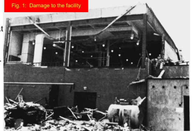
Fig. 1: Damage to the facility

[Reference: Kohlbrand, H. T., Plant/Operations Progress 10 (1), pp. 52-54 (1991).]