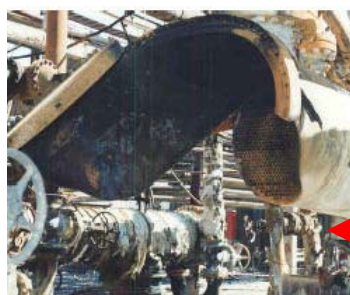
November: Cold Embrittle- ment