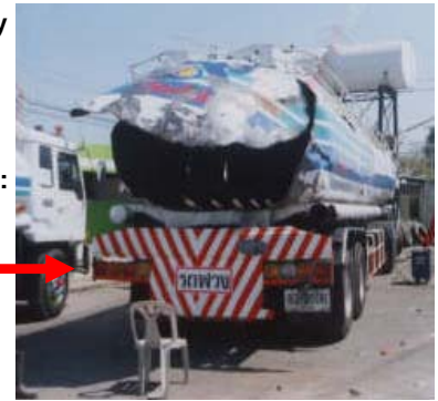
September: Hot Work Permits