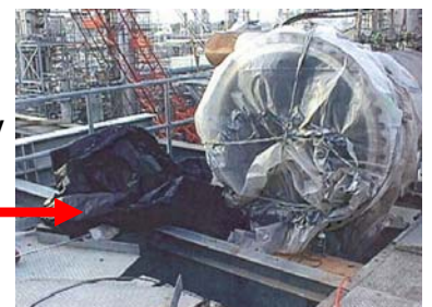
April: Emergency Response