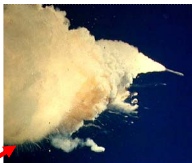
June: Safety Culture