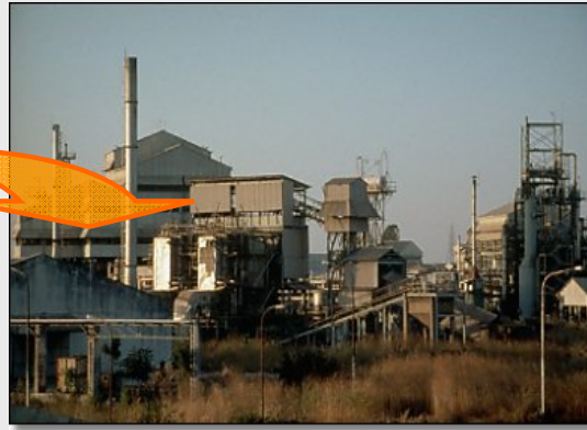
Union Carbide Bhopal Plant