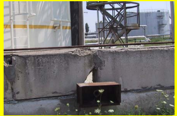
June – a hole in the wall of a tank farm containment dike

Can you figure out what the April, May, and June 2010 issues of the Process Safety Beacon have in common? All of them discuss a type of safety equipment that can generally be described as passive . Passive safety devices do not have to detect an unsafe condition or take any action to perform their protective safety function. They have no sensors or moving parts. They do their job because of their construction – for example, the insulating characteristics and thickness of insulation or fireproofing, or the height and impervious material of construction of a dike wall.