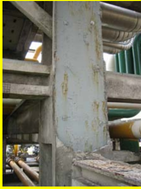
May – damaged fireproofing on a pipe bridge support column