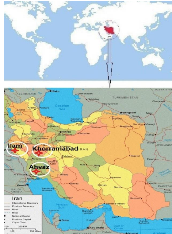
Fig. 1: Location of Ahvaz, Khorramabad and Ilam in Iran map

proportion (AP), which is described as the portion of the health result in a certain residents attributable to contact to a given air pollutant [3, 20].