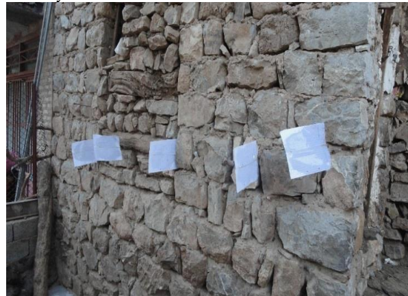
Fig. 2: A sampling site in Paveh County (sticky traps in livestock places), 2015