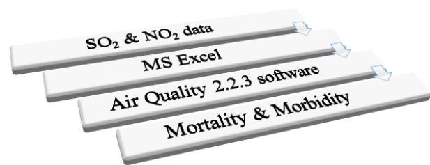
Fig.2 Data processing with use of Air Q 2.2.3 software