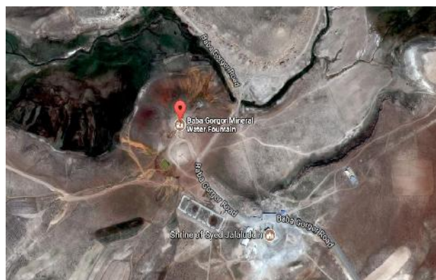
Fig. 1. Location of Kurdistan province on a map of Iran and the sampling site

west of Iran. Geographical coordinates of this fountain are between 35° 17' 22" geographical latitude and 47° 54' 14" geographical longitude. Water samples were collected in 1 L polyethylene bottles washed previously with 5% nitric acid and double-distilled water. Samples were stored at 4 °C and transferred to a laboratory after adding 1 ml of concentrated nitric acid. Temperature, pH, and electrical conductivity (EC) were measured by a portable Orion multiparameter device and the total amount of arsenic was measured using the Quantofix field kit at the sampling site. In laboratory experiments, total As and other heavy metals were measured by inductively coupled plasma-atomic emission spectrometry (ICP-AES). Also, As species were determined through the silver diethyldithiocarbamate (SDDC) method. The other principal anions and cations ( \text{Ca}^{2+} , \text{Mg}^{2+} , \text{Na}^+ , \text{K}^+ , \text{Cl}^- , \text{SO}_4^{2-} , \text{PO}_4^{3-} , \text{NO}_3^- ) were evaluated using a HACH DR 6000 spectrophotometer. All above physiochemical parameters were studied according to the Handbook of Standard Methods for the Experimentation of Water and Wastewater. 13 The sampling site is shown in Figure 1.