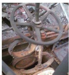
Figure 3 Line Blind after incident