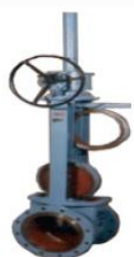
Figure 2 Line Blind