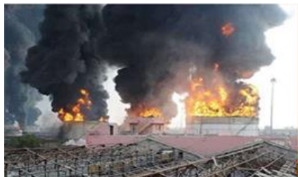
Figure 1 Storage Tank Fires