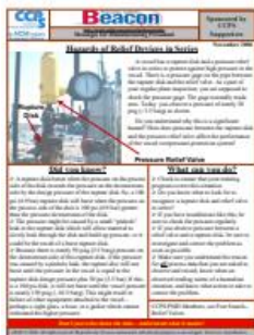
Figure 1 Process Safety Beacons across 20 years

Twenty years ago, a group of CCPS-member company representatives met and determined that a new process safety tool was needed. That tool was meant for frontline employees – mainly operations and maintenance personnel. The outcome was the CCPS Process Safety Beacon. From the first edition in November of 2001 as a text document, the committee has published it monthly and it is now emailed to over 30,000 subscribers. The readership has grown from a few hundred to an estimated 1 million.